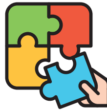
Puzzles and construction play