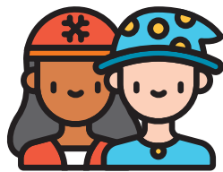
Dressing up and imaginative play