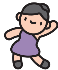
Dancing and drama