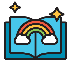
Exploring books, listening to stories and storytelling