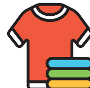
A change of clothes including socks and underwear

Check with your school or community kindergarten as to what else your child might need.