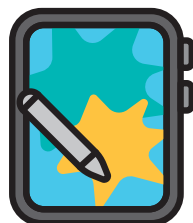
Using digital technologies