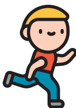
Climbing, balancing, running and jumping