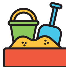
Playing with clay, play dough, sand and water