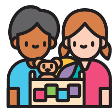
Opportunities to share with other children and develop independence