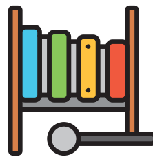
Singing, listening to and playing music