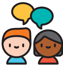
Talking and listening