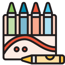
Painting, drawing, cutting and pasting

Your child will experience many different learning activities.