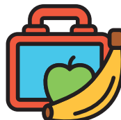
A lunchbox with lunch and some snacks